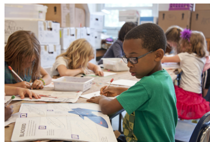
AL Department of Education