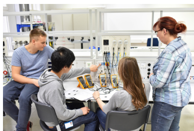
AL Department of Rehab Services