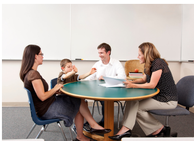
AL Parent Education Center